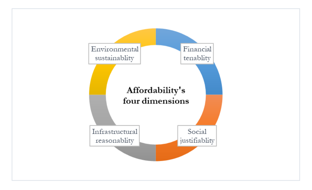
Figure 2: Four core dimensions of affordability in the context of frugal innovations 12

Financial tenability : Monetary affordability remains a core criterion for frugal products, services, business models and technologies. It is, however, not important that the price point of a frugal product is necessarily lower than a comparable substitute product because it is not the selling price at the point of purchase per se , but the total cost of usage and/or ownership spread over the entire product lifecycle, including costs of purchase, usage, maintenance and disposal, that determines financial tenability of an innovative solution.